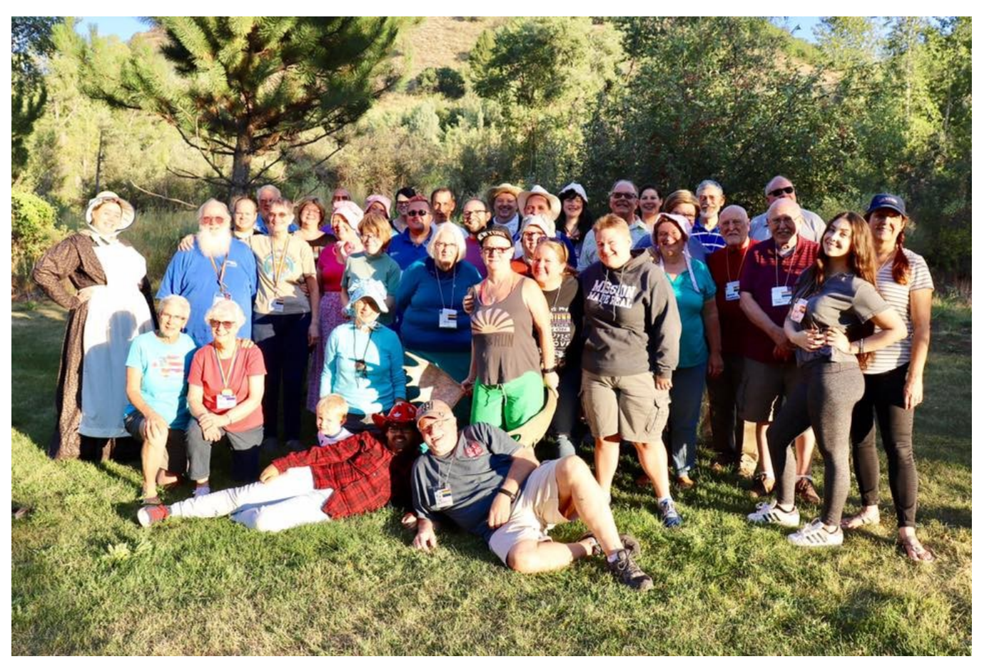
2017 Labor Day Retreat!

The 2017 GALA retreat is now part of our history—a lengthy history with many twists and turns in the road. This retreat is no different.